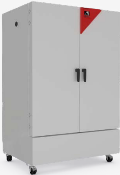
Model KB ECO 1020