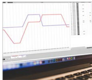
Multimanagement Software APT-COM™ 4